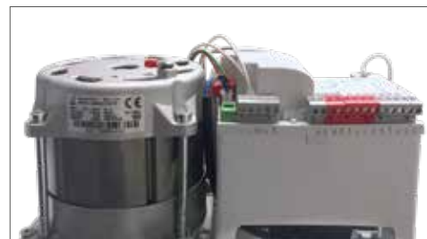
Sturdy and performing motors